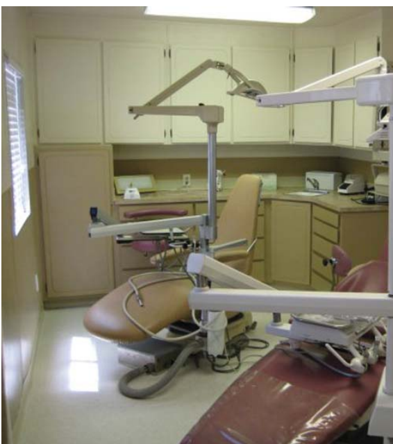
Volunteering at CARE Partnership Clinic is a long term project. Eventually, the clinic will be open five days a week and offer a permanent medical/dental facility and pharmacy.

CARE Partnership is the second clinic in the country to be student-run, along with the expertise of volunteer dentists and hygienists. The clinic's primary goals are to provide needed dental services while offering a unique learning experience for future dentists. Volunteer dentists and hygienists are still needed to reach the clinic's goals.