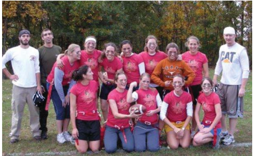
The 2011 Ladies play the 2010 Ladies in the Annual Powder Puff Football Game at Still-A-Bration. The competition was heated, ending in a 28-28 tie at the end of regulation. Overtime also resulted in a 28-28 tie.