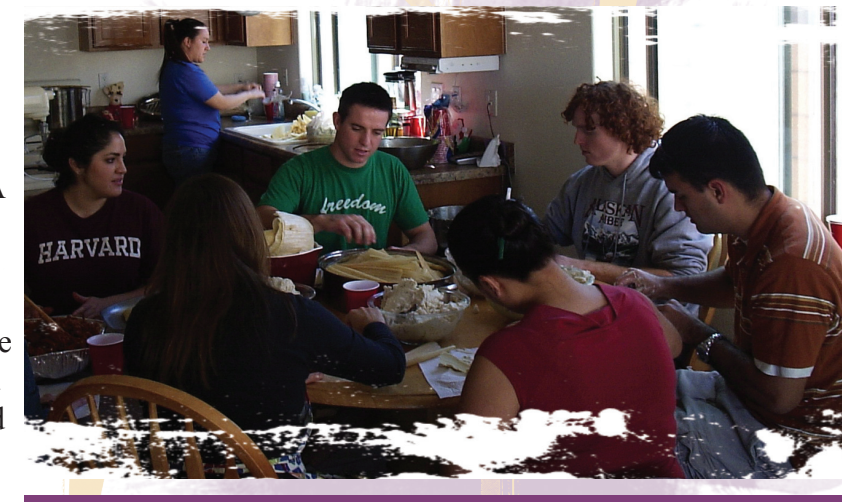
HSDA students and faculty made more than 600 tamales for the fundraiser.

The Hispanic Student Dental Association at ASDOH held its first annual tamale fundraiser in December, raising funds for upcoming projects and community events. After more than a month of planning, HSDA student and faculty members gathered together for a weekend-long tamale-making fest where more than 600 tamales were made. Nearly $600 was raised to improve the oral health of Hispanics throughout Arizona. HSDA thanks all who supported the sale and helped make it a success. HSDA welcomes and encourages all ASDOH students to be involved with the association, regardless of background. Many more fundraisers and community events are planned as the group prepares for the 2008 Annual Hispanic Dental Association Conference in Carefree, Ariz.. in November.