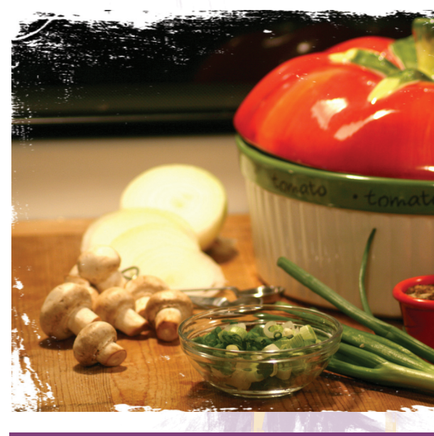
Proceeds from the cookbook benefit The Melonhead

The Kettel Society will continue to sell cookbooks throughout the year. To support the Kettel Society and The Melonhead Foundation, make a purchase by emailing kettel@atsu. edu.