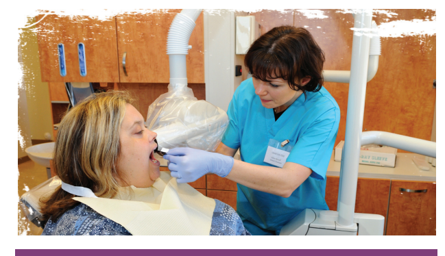
Dental Care West offers real-world insturctional opportunites for fourth-year dental students.