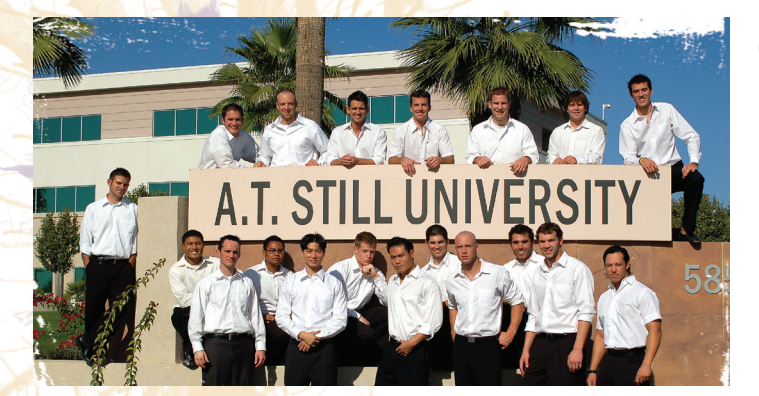
The 2008 Men of ATSU calendar cover.