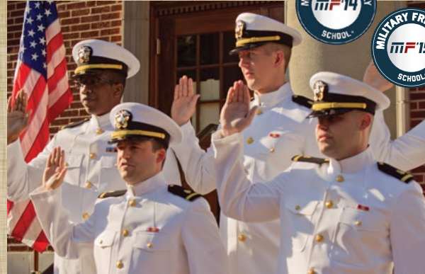
Military students from ATSU-KCOM's class of 2014 attend their commissioning ceremony prior to commencement.