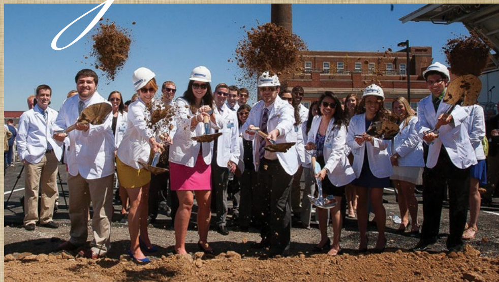
ATSU-MOSDOH's first class breaks ground on the new St. Louis Dental Education and Oral Health Clinic.