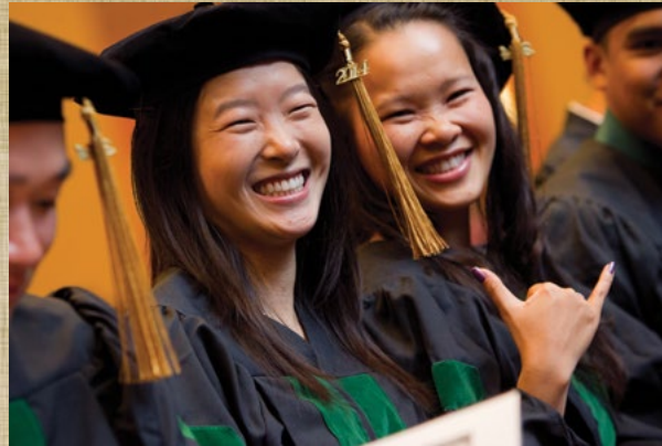
ATSU-SOMA graduates from the class of 2014 are ready for residency.

Several University programs successfully held accreditation site visits this year. ATSU-KCOM received maximum accreditation and was commended for its ultrasound curriculum and work in graduate medical education. ATSU's Arizona School of Dentistry & Oral Health (ATSU-ASDOH) received maximum accreditation status of "approval without reporting requirements" for its dental education program and advanced specialty education program in orthodontics and dentofacial orthopedics. Additionally, ATSU-Arizona School of Health Sciences' Doctor of Physical Therapy and Physician Assistant Studies programs were each granted accreditation for the maximum period.