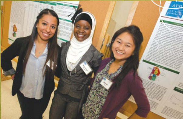
On Nov. 1, 2013, more than 100 faculty, students, and staff from regional universities attended ATSU's annual Interdisciplinary Biomedical Research Symposium.