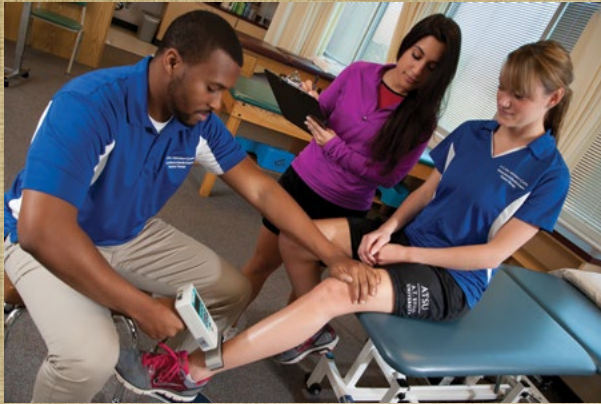
Physical therapy students work in groups to practice clinical techniques.