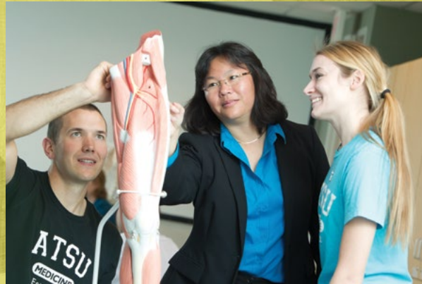
Faculty at ATSU's School of Osteopathic Medicine in Arizona work closely with students to ensure didactic and clinical success.