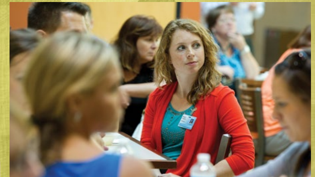
ATSU faculty and staff attend the Unity Campaign fundraiser kickoff, which benefits 13 partner agencies to help citizens in Northeast Missouri.

Each year, the University chooses three specific areas within the strategic plan to concentrate its efforts. For 2013-14, scholarly activity and research, learning-centered education, and University Advancement were areas of focus. To ensure the University is always moving forward and we maintain our momentum, ATSU is preparing its strategic plan for 2016-20. A steering committee is in place, and faculty, staff, and students will have an opportunity to help ATSU envision its future.