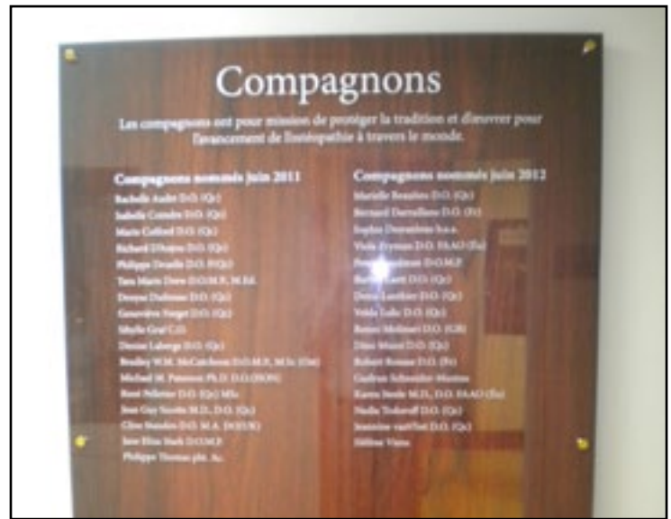
Compagnon de l'Ostéopathie plaque in Montréal, Quebec.