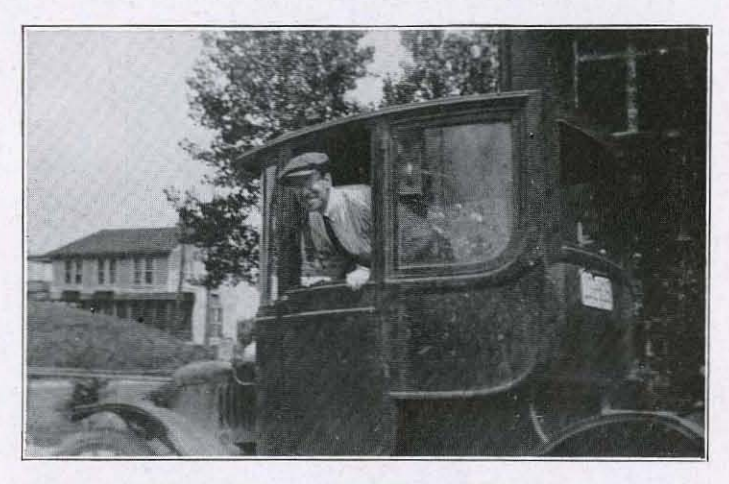
"THE FLOATING KIDNEY", Predecessor of "THE DERMOID CYST."

"Cars—Don't ever laugh at a Ford! Fords pass the big cars right along on any kind of roads and some of them never catch up. You can get parts and repairs in the smallest towns. Usually the repair can be made in a few hours. Fortunately we had very little trouble. Two punctures, two blow-outs, back spring broken, brakes burnt out in Yel-