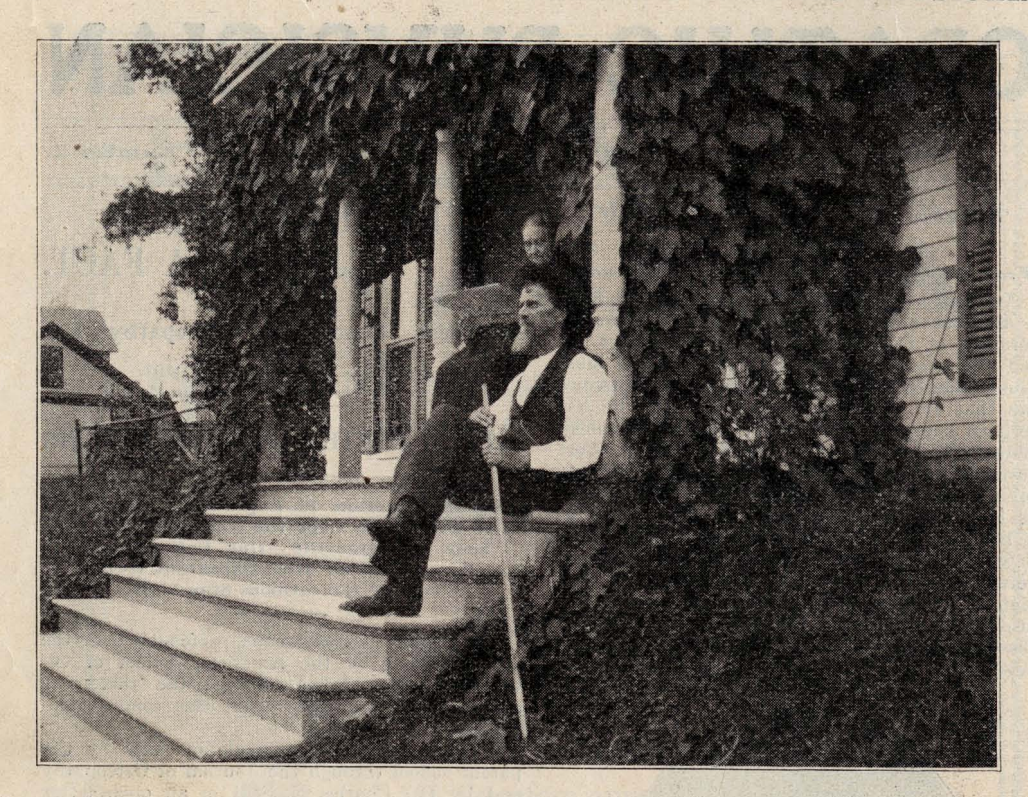
Summer at the Old Homestead

in any other quarter. And why shouldn't they be? Who has more at stake for the reputation of Osteopathy, on priniple, for sentiment or financially?