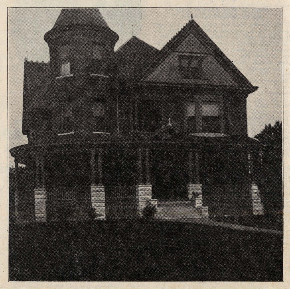
Pap's "Castle on the Hill"

We realize that cur practitioners in order to more successfully conduct the general practice they are gradually drifting into need a broader and more thorough professional education, and