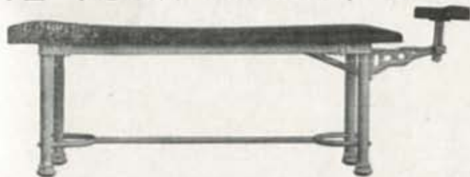
PATENT APPLIED FOR.

while "breaking up" the lumbar spine. You need not lift the legs of that 200-pound patient off the end of the table and swing his feet in mid-air at the cost of your own strength.