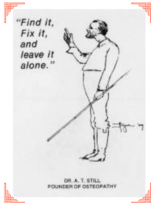
Museum Collection [PM 161 postcard] ca.1909

other was the unbelievable aquiline of the nose. They harmonized with each other of course and were not ordinarily noticeable, until some trick of posture or background threw them into relief. His moustache helped to—shall I say normalize—his nose, and moustache and beard kept nose and forehead in harmony. And why should anyone bother about that? I do not know why: have not given it much thought; but observe that my fellow human beings do seem to “set considerable store” by it—it being physical appearance generally.