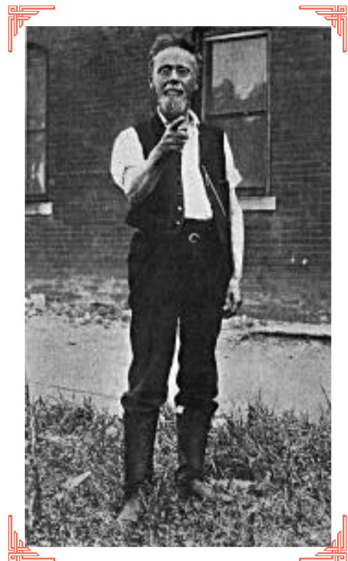
Museum Collection [PIC-Stat-27] ca. July 1908