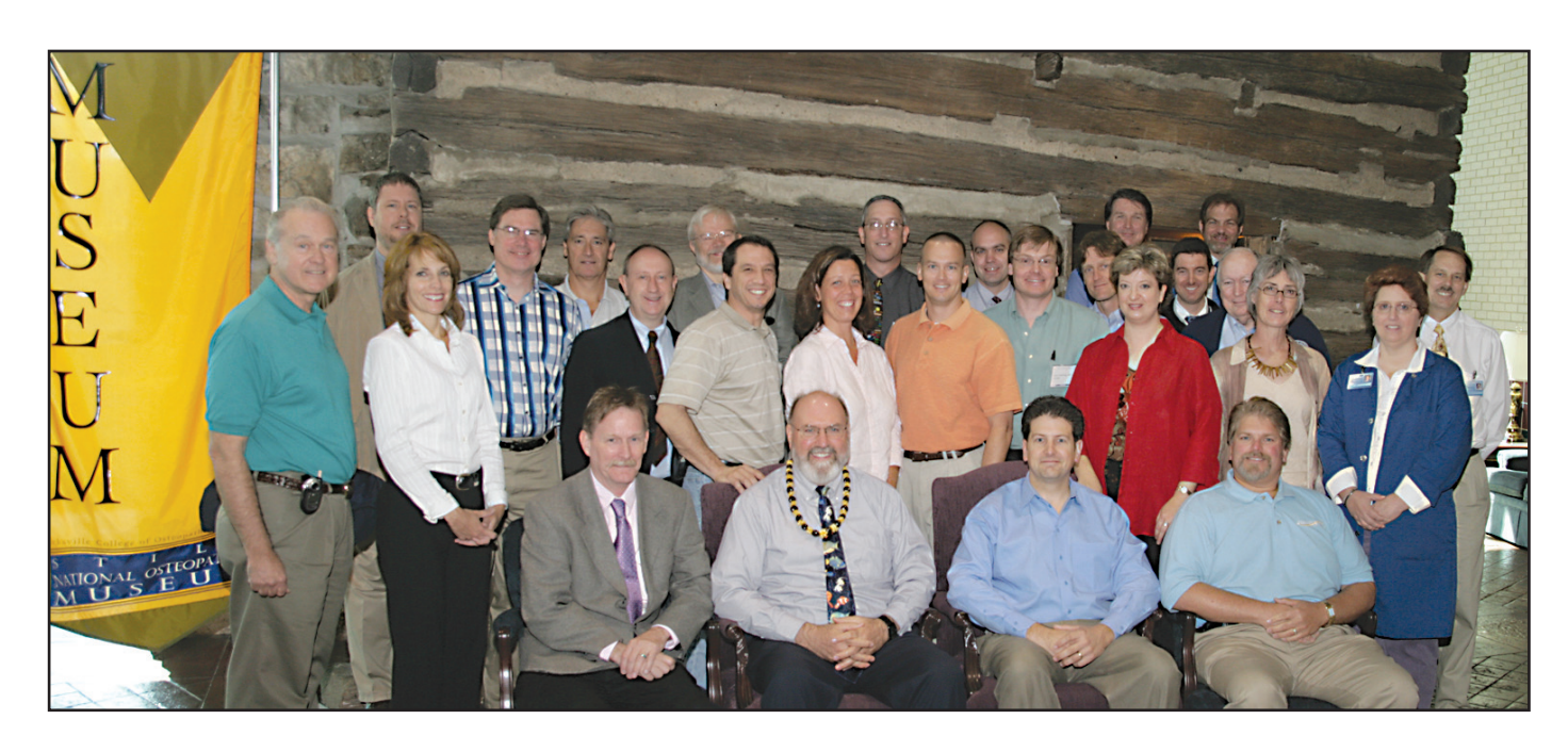
Educational Council on Osteopathic Principles visits Still National Osteopathic Museum

While on the A.T. Still University Missouri Campus for a three-day workshop In September, the Educational Council on Osteopathic Principles (ECOP) presented the Still National Osteopathic Museum with a generous gift of more than $8,500.