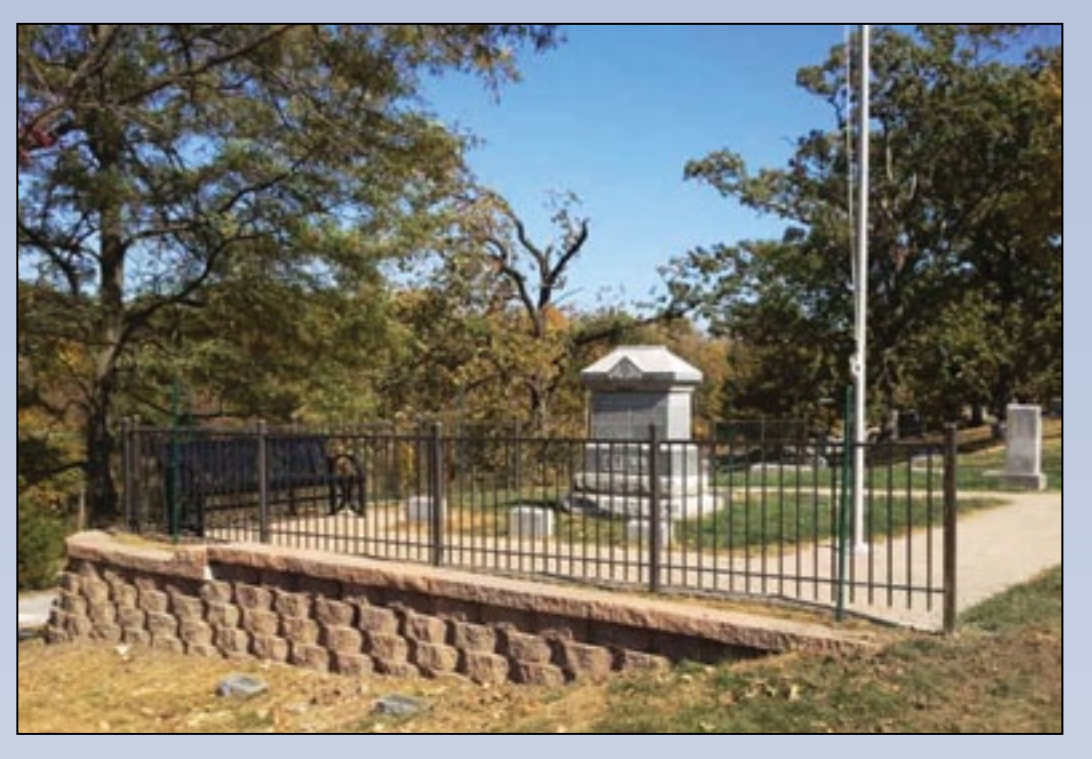
Gravesite improvements include: an elevated site via retention walls, new sod, brick pathways, iron benches, ornamental fencing, and re-set grave markers. In 2012, the museum will assist in making several other improvements to the site in Forest Llewellyn Cemetery.

Last year, a campus committee recommended making some basic improvements to the site, such as leveling the sod leading to the site. After a preliminary survey, however, more elaborate plans were drawn up to create a small park-like setting amidst the gravestones. Among the improvements: leveling the heavily-sloped site via a retention wall, installing a series of brick pathways in and around the graves, leveling and realigning the gravestones,