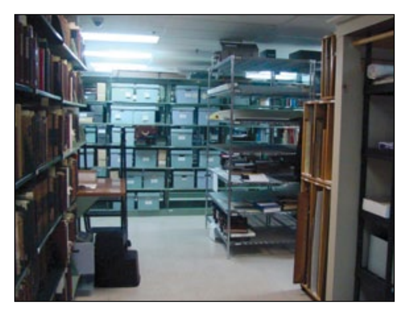
A current image of the closed stacks (main artifact storage area) inside the ICOH. The latest move included the purchase and installation of high-quality chrome-plated, impact-resistant shelving and infrared camera security surveillance; the new space will also soon include water level (flooding alarms, an updated fire-suppression system, and key-pad-entry door alarms.

Since the publication of our last newsletter (Autumn 2010), the museum has now fully moved into our "new" International Center for Osteopathic History (ICOH) collections storage and office space in the east basement of the Gutensohn Osteopathic Health and Wellness Clinic Building. Although construction and renovation on the space was completed in the summer of 2010, some of the collection was still being stored in our old location in the basement of the George Still Building. Since then, the remaining artifacts have been moved into either the new ICOH space or the recently-renovated Annex storage space. We knew that the planning, construction, and moving process would take a couple of years, but now that we're fully moved into our new home, it is nice to have the disruption of a major move behind us.