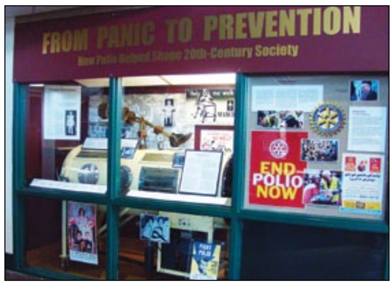
The new exhibit on Polio—From Panic to Prevention: How Polio Changed Public Health and Society in Mid-20th Century America

of the early- to mid-20th century. In the broader context, the exhibit addresses how the convergence of technology, medical knowledge, and public health concerns brought about significant changes in healthcare during the height of the polio epidemics in the 1940s and '50s. Two of the three most significant developments in the fight against polio, however, did not come in the form of technology or medical knowledge; the new weapons were public awareness (the