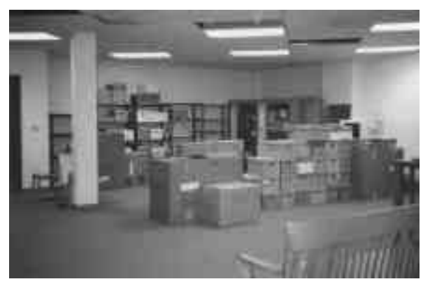
Main Gallery 1995

The Museum will be celebrating a 10th anniversary this April; can anyone guess the occasion? It was a full decade ago that the Still National Osteopathic Museum became part of the Kirksville College of Osteopathic Medicine. Many things have changed; more accurately, many things have expanded – the size of the collection, the number of staff, our facilities, and especially our exhibit galleries. Quite frankly, one has to sometimes step back to realize how much we have grown.