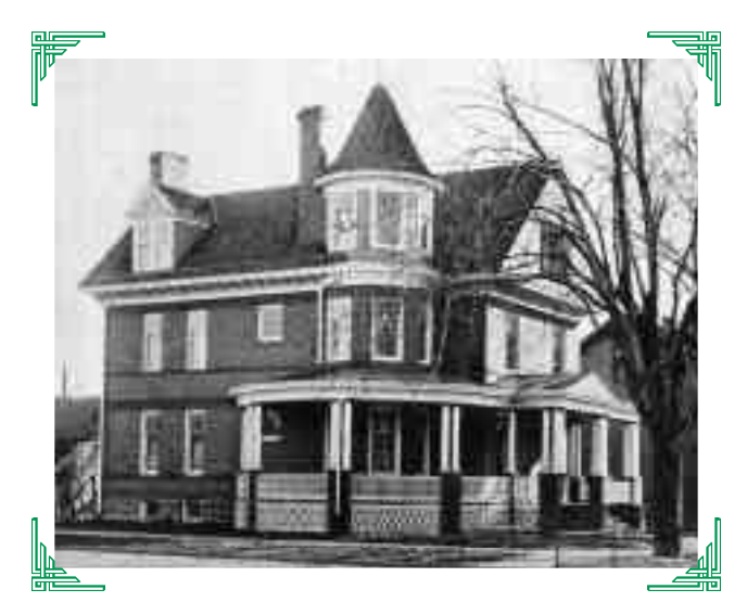
The Theta Psi fraternity house was turned into the Red Cross Contagious Hospital on November 16, 1918. It operated for one month during the height of the pandemic in Kirksville.

Milbank property that had been used as a chapter house by the Theta Psi fraternity was completely equipped and four patients had been admitted.<sup>12</sup>