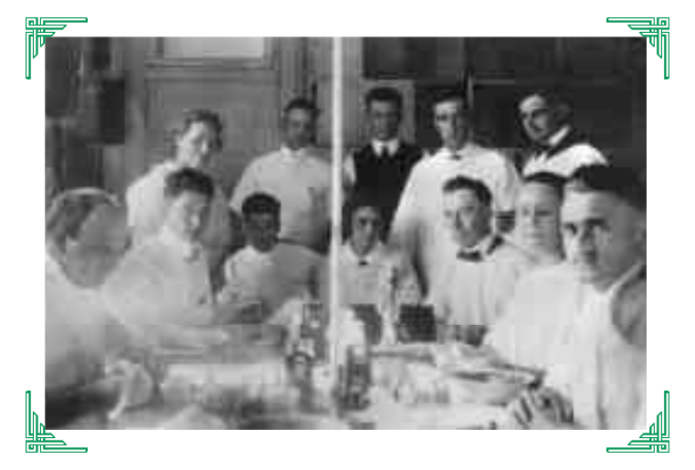
Students from the Class of 1918, seen studying in a laboratory. The American School of Osteopathy permitted students to miss class in order to assist with the pandemic.

health tragedies have diminished populations time and again throughout the world. Survivors have immortalized these deadly diseases with names that reflect either the most notable symptom of the illness, location of its origin, or current ruler. During the past 2,500 years, some names that have been coined include Peloponnesian War disease, Antonine Plague, Justinian Plague, Black Death, Red Death, Cholera, and Asiatic Flu.