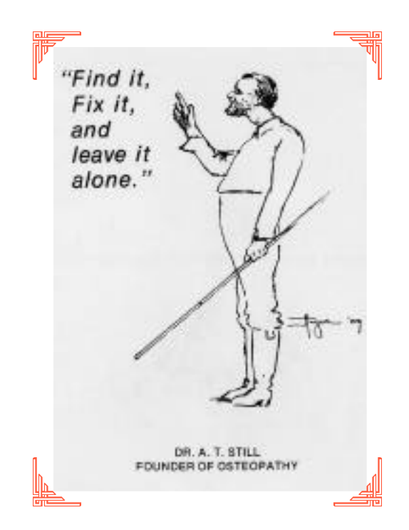
Museum Collection [PM 161 postcard] ca.1909

other was the unbelievable aquilinity of the nose. They harmonized with each other of course and were not ordinarily noticeable, until some trick of posture or background threw them into relief. His moustache helped to—shall I say normalize—his nose, and moustache and beard kept nose and forehead in harmony. And why should anyone bother about that? I do not know why:have not given it much thought; but observe that my fellow human beings do seem to "set considerable store" by it—it being physical appearance generally.