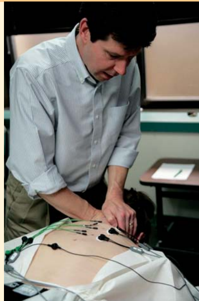
Fig. 2 Resisted trunk extension as a task to normalize EMG signals of the deep and superficial back muscles.

The traditional paradigm for diagnosis and treatment is mechanical, where multiple planes of motion loss are determined and each restrictive barrier is engaged to increase the motion in all restricted planes [28–31]. The identification of motion restriction has been based on the spinal coupled motion model proposed by Fryette [27], which describes two types of coupled motion restriction: Type 1, also known as contralateral coupling, is based on spinal asymmetry in neutral, while Type 2, also known as ipsilateral coupling, is based on non-neutral spinal postures. Fryette's model has been criticized for its prescriptive diagnostic labelling and questionable inferences from static positional assessment [32, 33]. Further, it allows only three combinations of multiple plane motion restrictions, a neutral Type 1, a non-neutral Type 2 with flexion, or