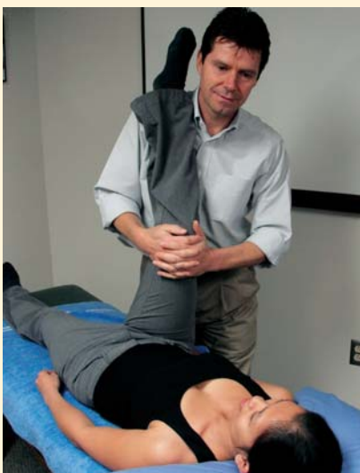
Fig. 5 Application of MET for stretching of the hamstrings muscles.

Applications of MET to stretch and increase myofascial tissue