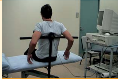
Fig. 3 Goniometer used for study which tested effectiveness of MET to increase trunk rotation.

Determining the physiological mechanisms of MET is ongoing, but available evidence does not support some of the commonly proposed theories for therapeutic effect. The underlying therapeutic mechanisms may involve a variety of neurological and biomechanical factors. MET may also have a physiological effect regardless of presence or absence of dysfunction [19, 20]. Hypoalgesia, altered proprioception and motor control, and changes in tissue fluid are likely to underlie the therapeutic effect of MET.