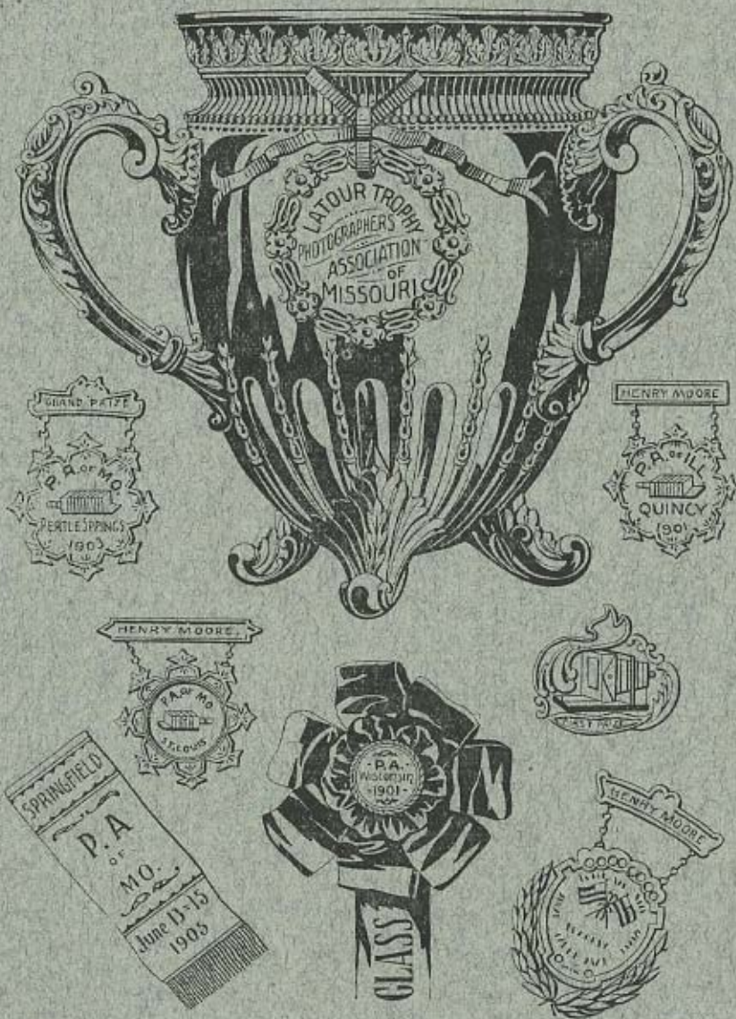
Medals, Trophies, etc. awarded Henry Moore at various Associations.

Visit this Studio and see the class of work we are doing