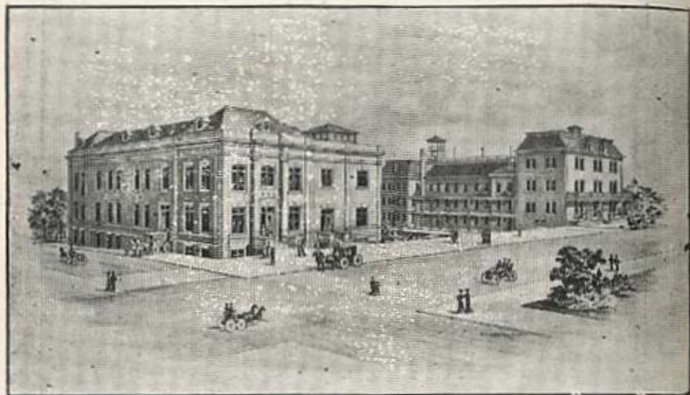
THE AMERICAN SCHOOL OF OSTEOPATHY AND A. S. O. HOSPITAL, KIRKSVILLE, MO