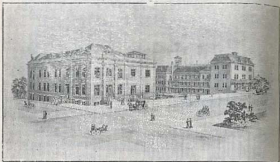
THE AMERICAN SCHOOL OF OSTEOPATHY AND A. S. O. HOSPITAL, KIRKSVILLE, MO.