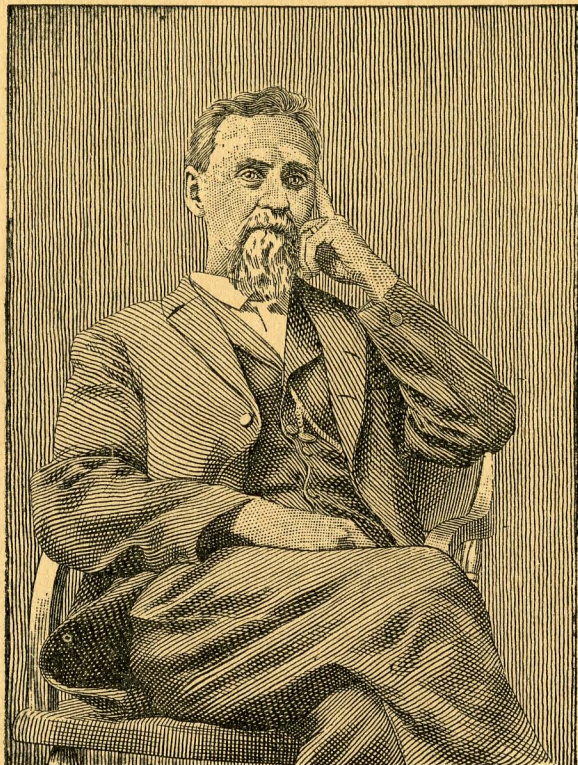
DR. A. T. STILL.

Madam: Judge, I know something of your duty and will state if I know "and what I know." I do know that your oath when you took your seat was to do justice equal and exact to all without prejudice. And will