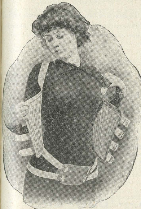
Front View Appliance No. 1.

EVERY OSTEOPATH KNOWS how important it is to keep the spinal column in perfect adjustment after each treatment.