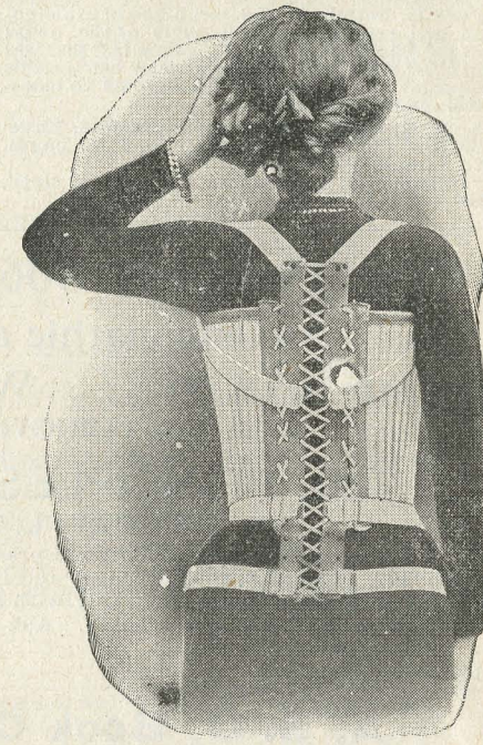
Back View Appliance No. 2

We will be very happy to send to you our full literature, knowing that it will prove of unusual interest to you, also our Measurement Blanks. Special Terms to Osteopaths.